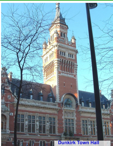
Dunkirk Town Hall

Organised by HARRY SHAW Group Travel on behalf of Coventry NARPO