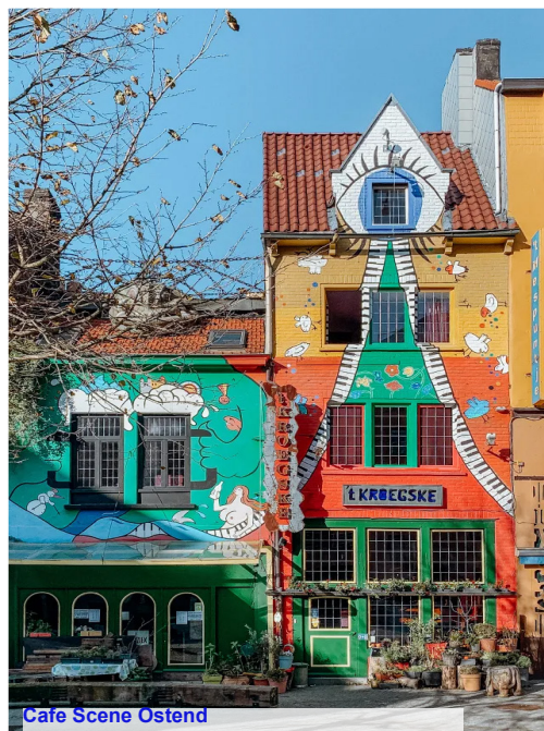
Cafe Scene Ostend