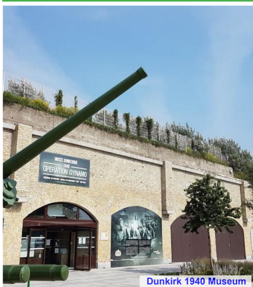
Dunkirk 1940 Museum

Organised by HARRY SHAW Group Travel on behalf of Coventry NARPO